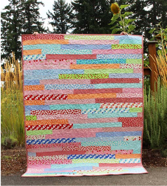
Finished size 51" x 64.5"