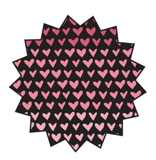
31" x WOF